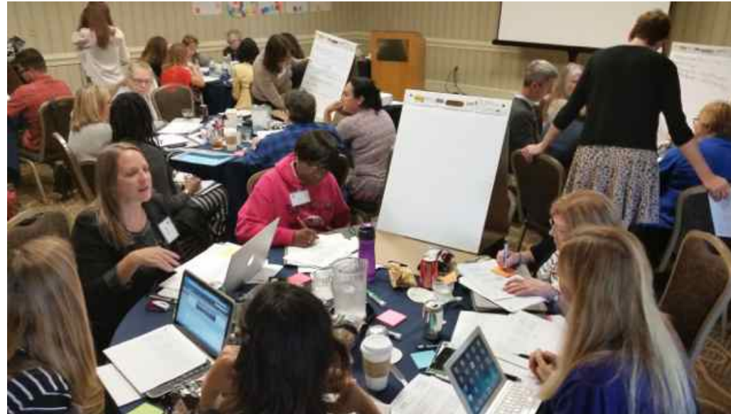
October 3rd & 4th OEI Reviewer's Training

30 reviewers trained from 29 colleges across the state