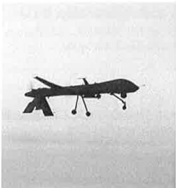
Drones were used for the first time in a civil application. They were able to fly through the heavy smoke that planes could not.