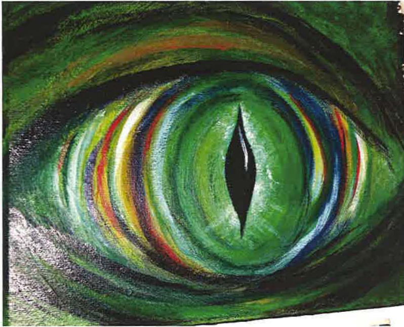
"Mystery Eye" Aileen Bales Medium: Acrylic Oils