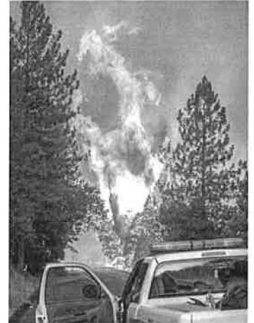
Flames towered over the tree line