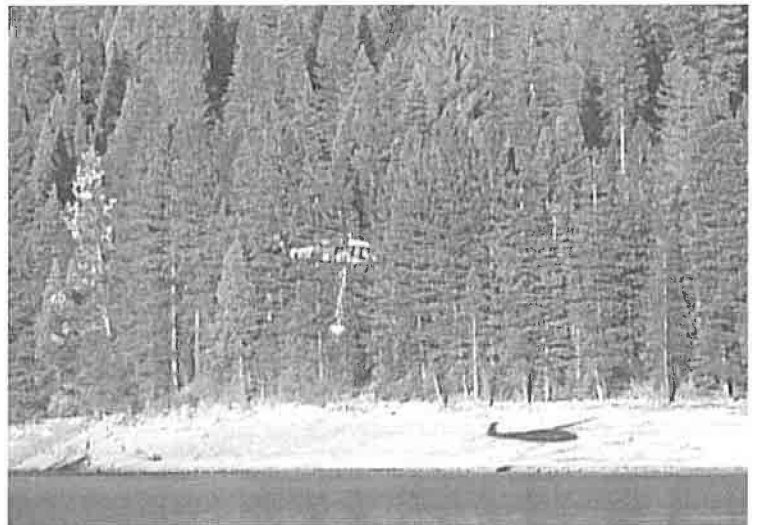
Helicopter flying over Lyons Dam