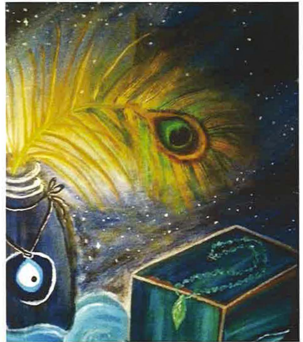
"Peacock midsummer night dream" Aileen Bales Medium: Acrylic Oils