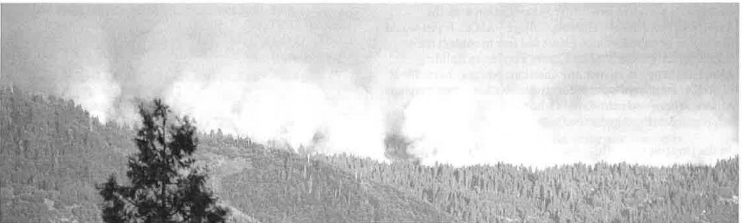
Rim Fire seen from Cedar Ridge